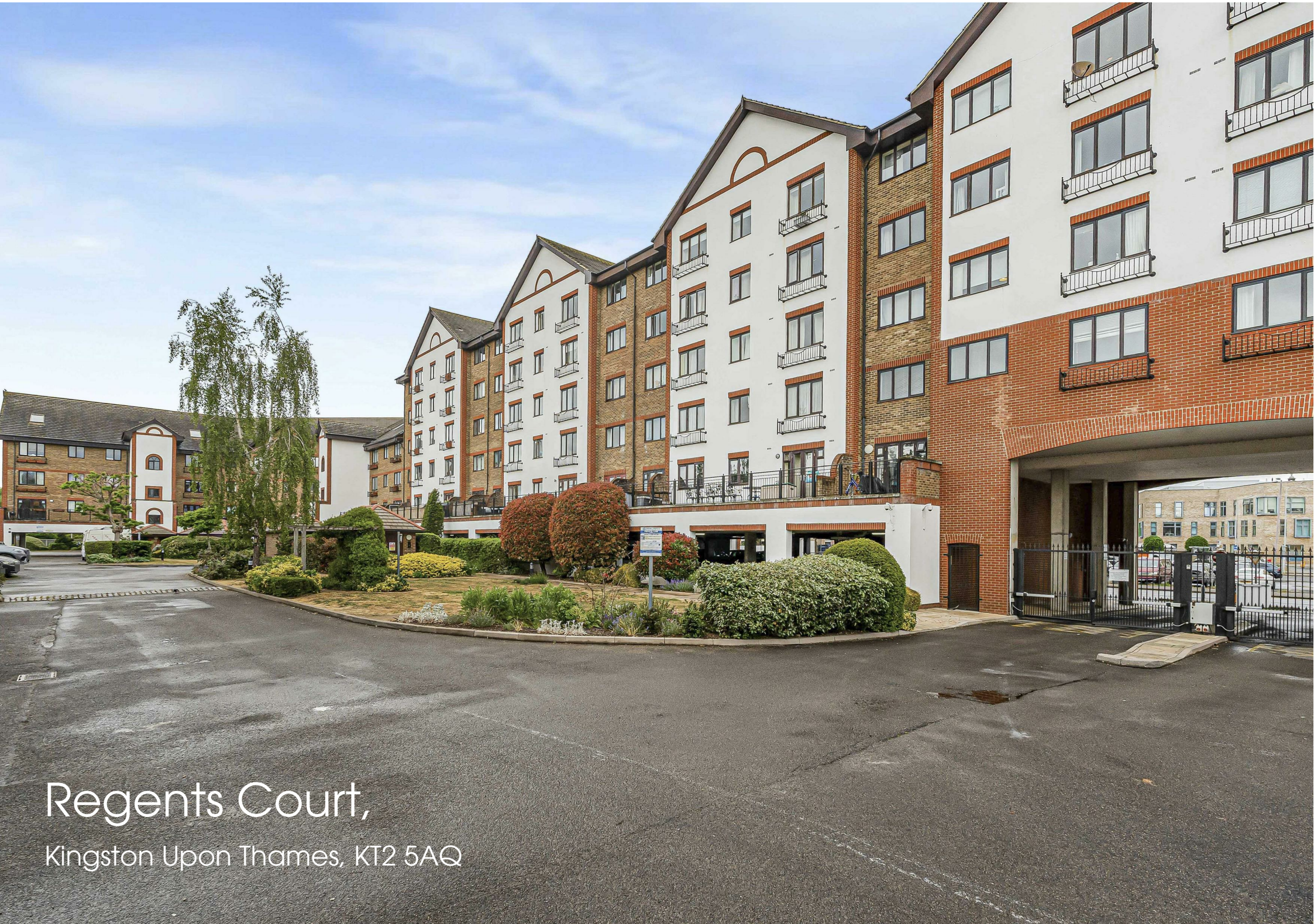
Regents Court, Kingston Upon Thames, KT2 5AQ